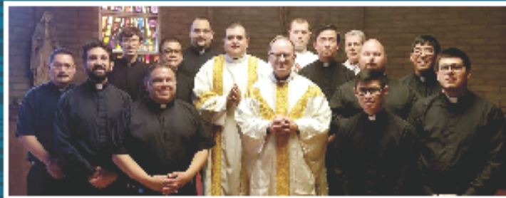
The Seminarians of the Diocese of Oakland present

YOUNG MEN AGES 13-18 ARE INVITED TO JOIN US FROM JULY 15-18, 2018