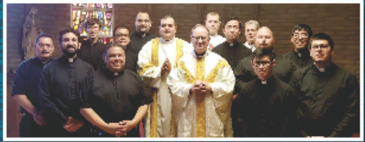
The Seminarians of the Diocese of Oakland present

YOUNG MEN AGES 13-18 ARE INVITED TO JOIN US FROM JULY 15-18, 2018