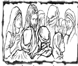
Jesus heals a sick woman

Wisdom 1:13-15; 2:23-24 Psalm 30: 2, 4, 5-6, 11, 12, 13 2 Corinthians 8: 7,9, 13-15 Mark 5: 21-43