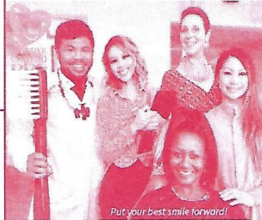
Put your best smile forward!

www.sanpablofamilydentist.com 2089 Vale Rd, #30, San Pablo