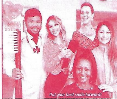
Put your best smile forward!